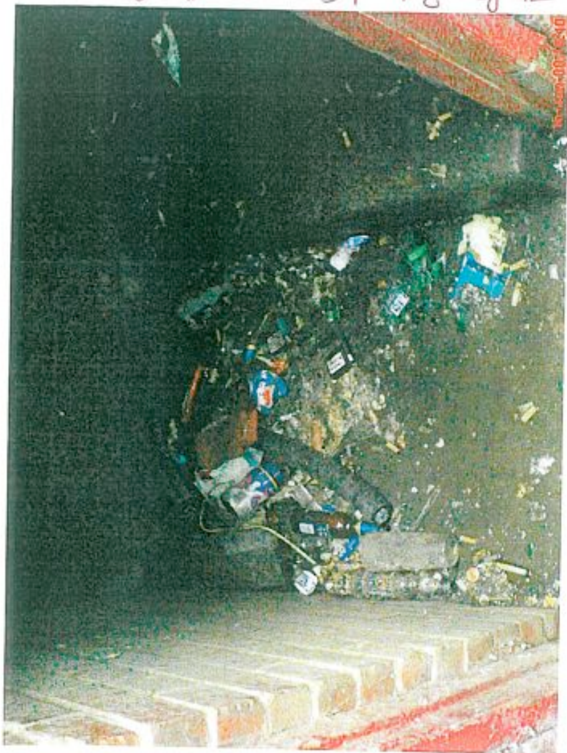
The Room - Bottom of fire escape 16 th Jan 2008